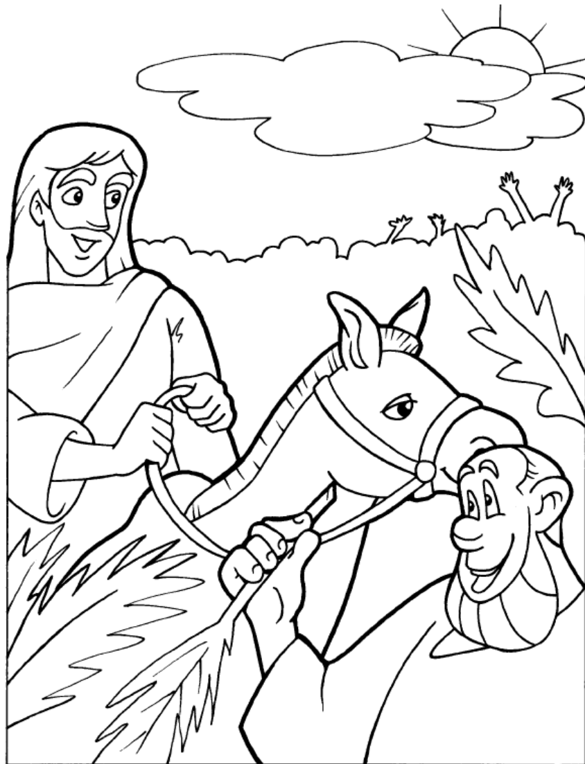
The Triumphal Entry