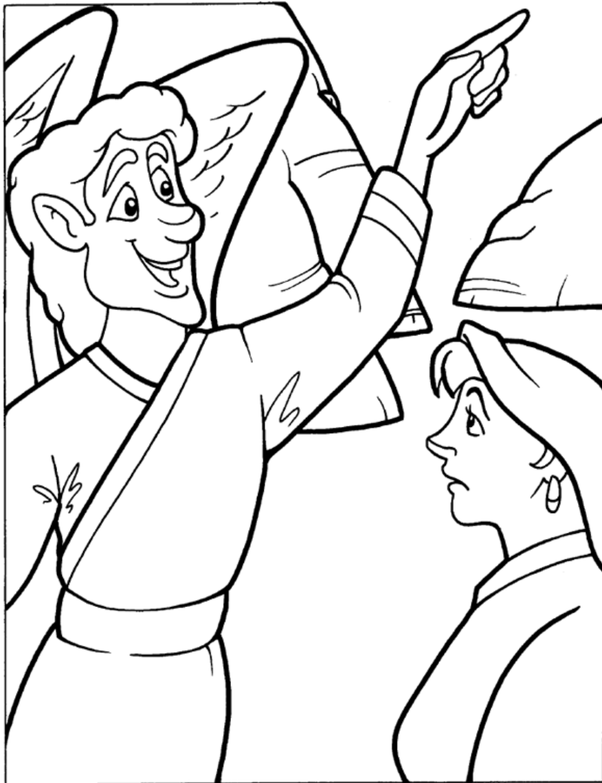
Jesus Is Alive!