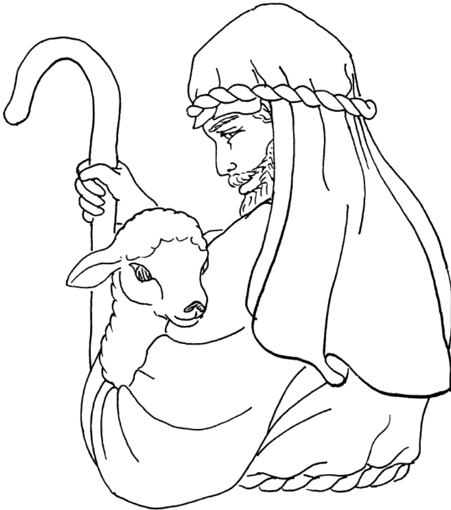
The Good Shepherd