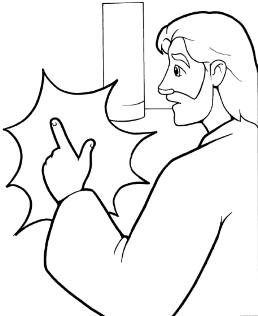
Jesus Appears to the Disciples