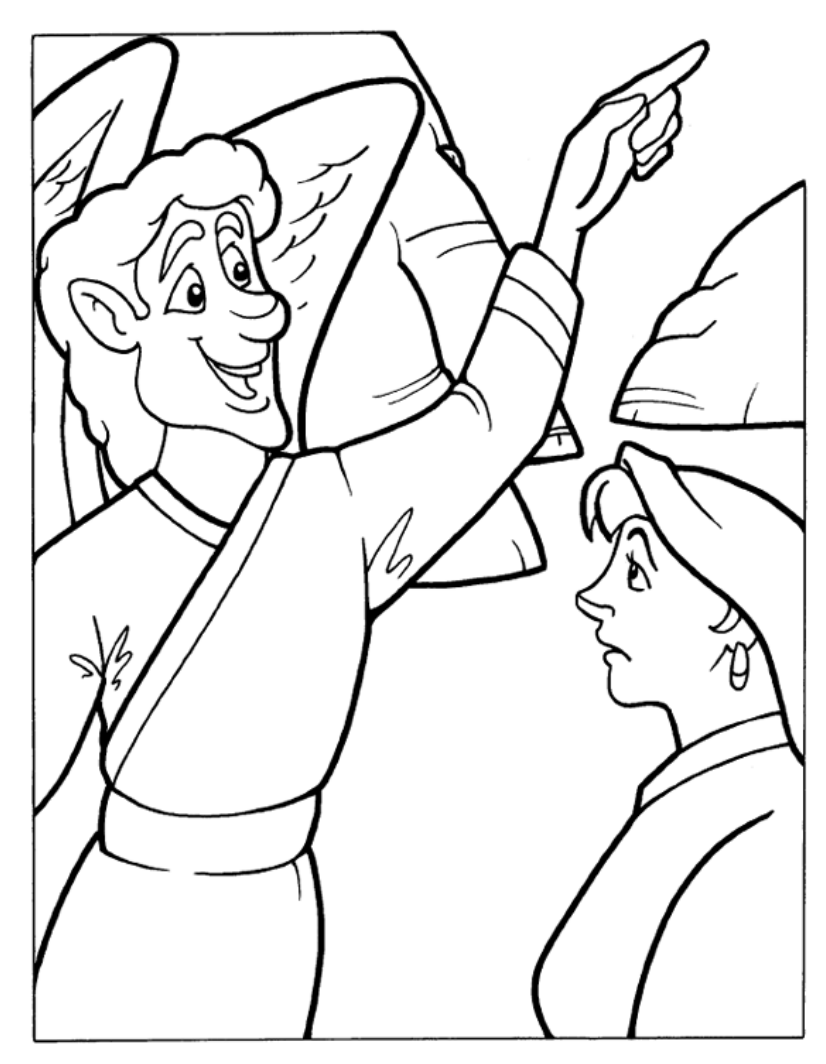
HE IS NOT HERE! HE IS RISEN!